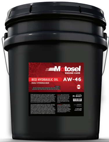
#M-0427 / 18.9 L #M-0430 / Bulk